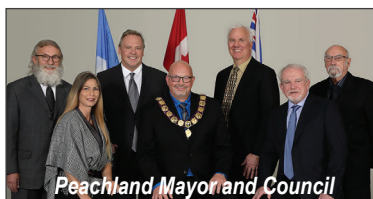
Peachland Mayor and Council

THANK YOU! Your input is greatly appreciated. Questions about this survey? 250-767-2647 info@peachland.ca