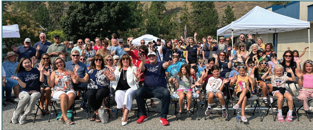
Peachlanders and special guests including Hon. Anne Kang, BC Minister of Municipal Affairs celebrated the special announcement on August 9.

The new child care centre will be socially, economically and environmentally sustainable and help to build a more complete community