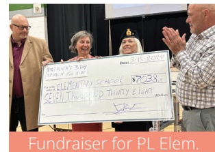
Fundraiser for PL Elem.