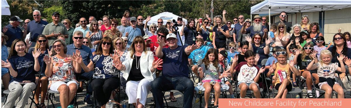
New Childcare Facility for Peachland