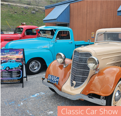
Classic Car Show