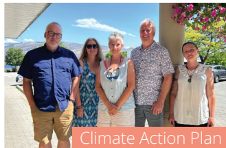
Climate Action Plan