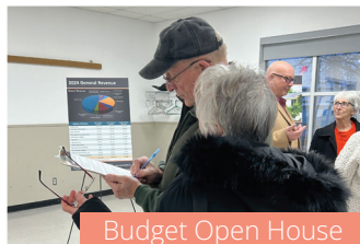
Budget Open House