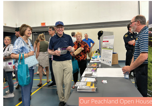
Our Peachland Open House