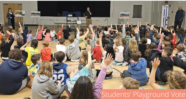
Students' Playground Vote

Peachland enjoyed tremendous support in 2024 from our provincial and federal governments and engaged the community like never before, hearing from all ages and actively involving Peachland volunteers in improving our community. Read about the successes in this month's Mayor's Message (page 4).