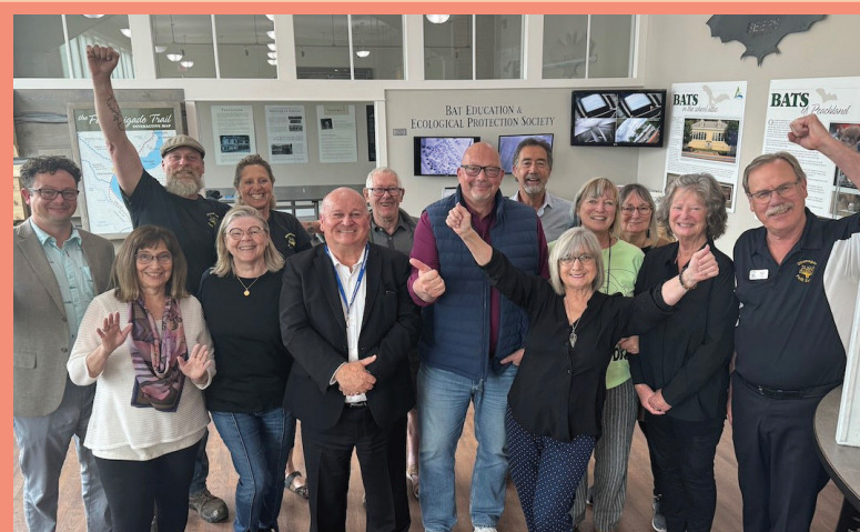
Mayor Patrick Van Minsel was happy to help celebrate the signing of the lease agreement for the Historic Schoolhouse, now the home of OUR SPACE, an arts and culture collaborative.

Visit www.peachland.ca/council Contact Council at council@peachland.ca or call 250-767-2647